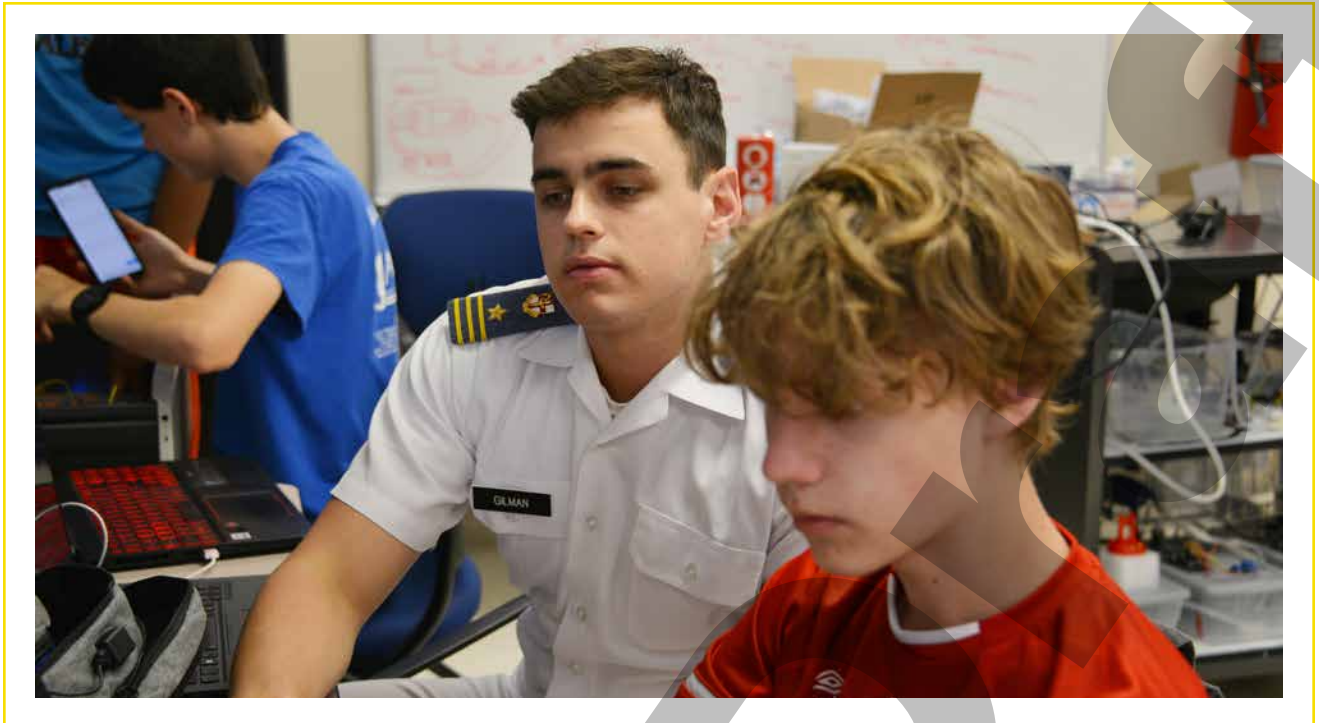
Virginia Military Institute, in collaboration with Virginia Tech, held a 12-week internship for high school students, funded by a workforce development grant from the Commonwealth Cyber Initiative. The grant seeks to build a pipeline of mentorship in which graduate students from Virginia Tech, (with more knowledge and experience on cyber security topics) mentor VMI cadets, and in turn the cadets mentor local high school students. The goal of the internship is to teach the high school students how to develop practical hardware, software, and cybersecurity skills through in-person practical learning and self-paced online training.